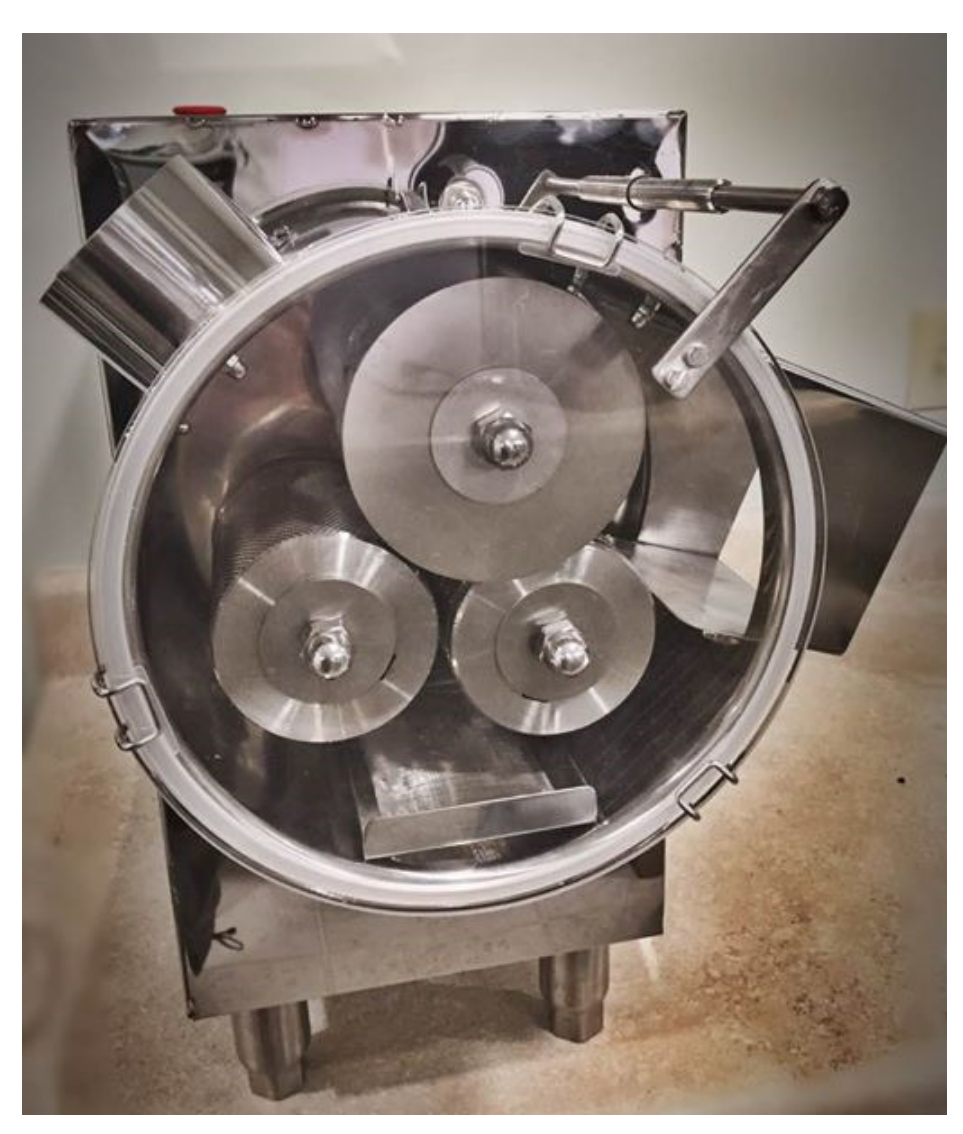
JUICERNET BY MULLIGAN ASSOCIATES, INC.

286 Barbados Drive, Jupiter, FL 33458 (800) 627-2886 / (561) 745-8733 (561) 277-2466 Fax www.juicernet.com