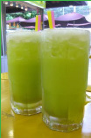
Serve Over Ice