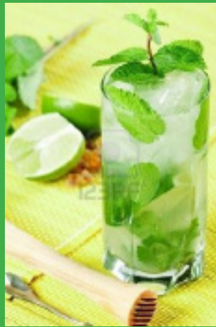
Mix for Mojitos